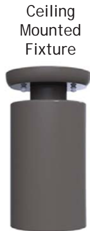
Ceiling Mounted Fixture

Beachfront lighting can also cause sea turtle hatchlings to become disoriented and wander away from the ocean towards the brightest lights. Hatchlings that head toward artificial lights often die from dehydration, exhaustion, terrestrial predation and passing cars.