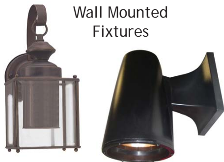
Wall Mounted Fixtures