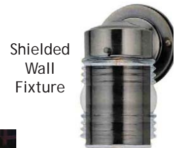
Shielded Wall Fixture